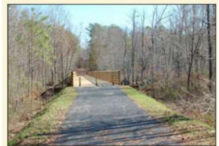
The Virginia Capital Trail

The Williamsburg area is “bicycle friendly” with dedicated bicycle/multi-use paths as well as bike lanes. Routes are available to provide a variety of ride options and lengths. Routes will be available to/from the hotel and Jamestown, Yorktown and Colonial Williamsburg. For those desiring to ride further distances and explore the countryside, longer routes will be available in surrounding counties of James City, Charles City, York and Surry (accessible via a free ferry). For those that opt for the safety and calm of dedicated bicycle paths, the Virginia Capital Trail and Powhatan Creek Trail offer many miles of scenic riding. The Virginia Capital Trail extends 52 miles from Jamestown to Richmond! The Colonial Parkway will be used on some of the routes as well.